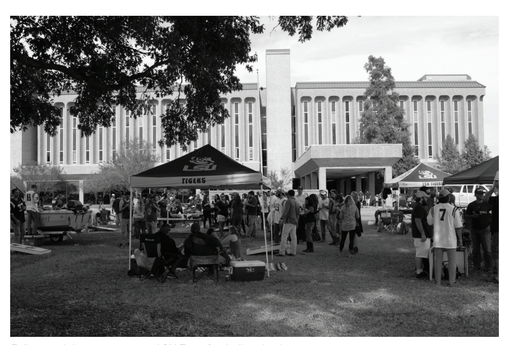
Fall in south Louisiana means LSU Tiger football and tailgating.

The Department of University Recreation provides a variety of recreational activities. To meet the diverse needs and interests of the University community, a multifaceted recreational program is offered that includes aquatics, informal recreation, healthy lifestyle programs, intramural sports, adventure recreation, sport clubs, and special event activities. For additional information, contact the Department of University Recreation.