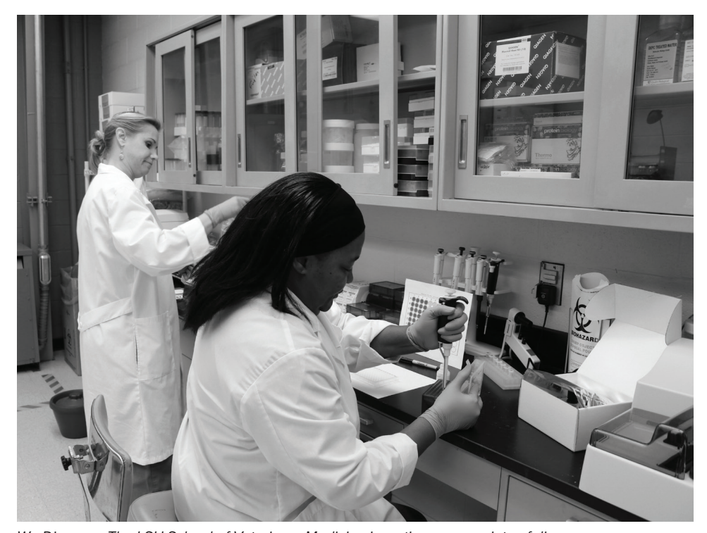
We Discover: The LSU School of Veterinary Medicine investigages a variety of diseases.

The safest and most effective method of preventing rabies in high risk groups is by pre-exposure vaccination. Because the risk of exposure is especially high for students of veterinary medicine, it is the policy of the School of Veterinary Medicine that all students must receive pre-exposure rabies vaccine before or during the fall semester of their first year in the professional curriculum. The vaccine will be available through the LSU Student Health Center for enrolled veterinary medicine students