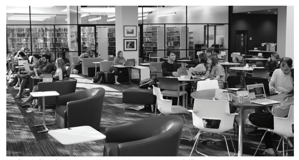
We Teach: The LSU Veterinary Medicine Library is accessible 24/7.

All fees are estimates and the LSU Board of Supervisors may modify tuition and/or fees at any time without advance notice. Check current tuition and fees at www.lsu.edu/bqtplan/Tuition-Fees/feeschedules.php.