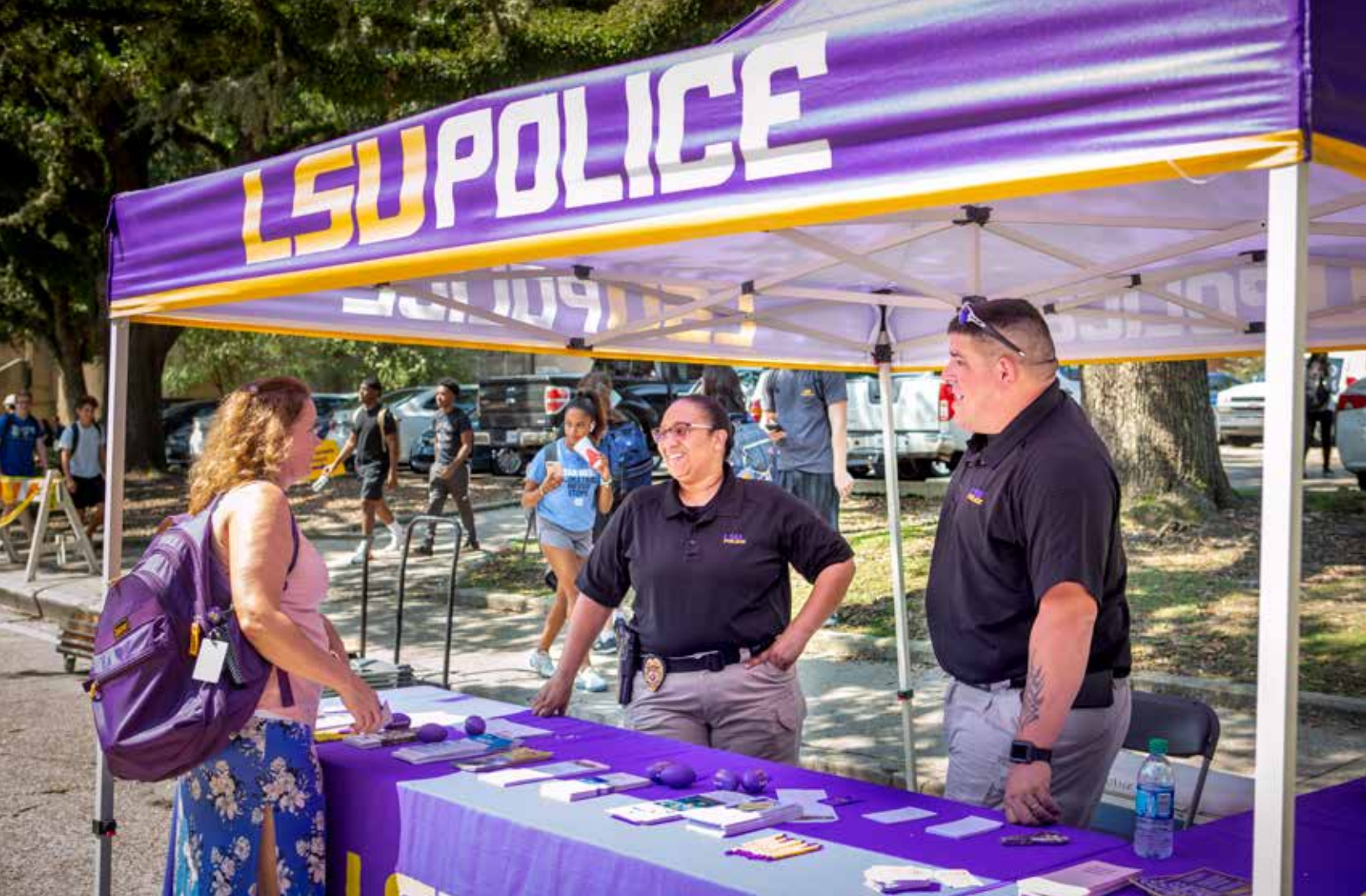
The LSU Safety Day event on campus features a booth set up by LSU Police to provide information and resources.