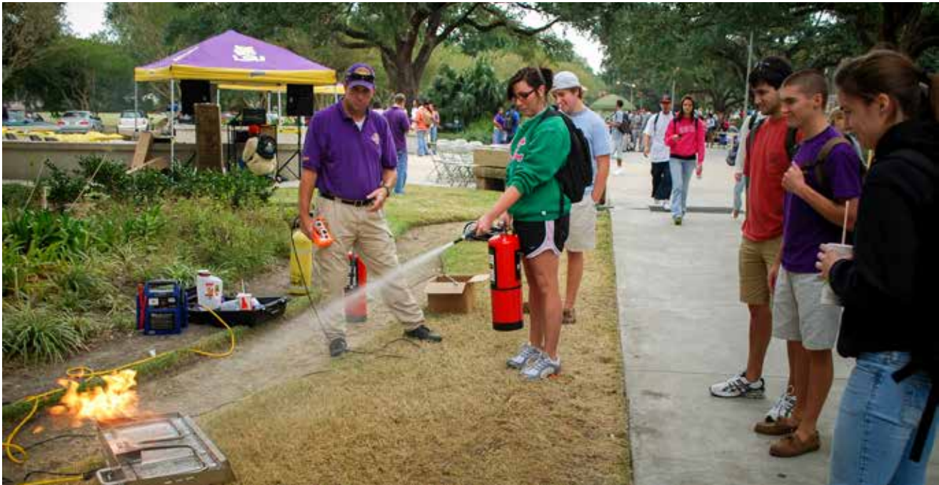
On LSU Safety Day, students are provided the opportunity to learn how to properly discharge a fire extinguisher under supervision.