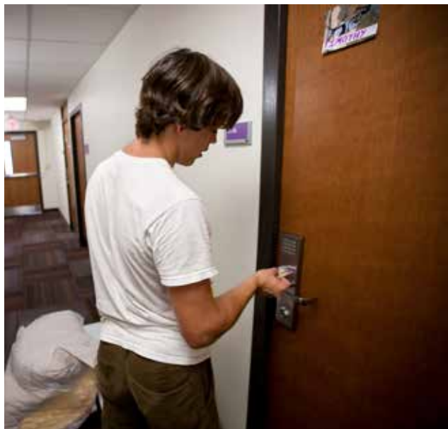
All residence halls have limited, card access only.

Policies to maintain safety within residence halls include staffed desks in residential halls 24 hours a day. All residence halls have limited, card access only through main doors. Procedures for guest visitation are established, and hours are set by the residents of each building in accordance with rules printed in the Living on Campus Handbook, issued to all residents and available at hall desks and online at lsu.edu/housing . Residence halls are equipped with fire safety equipment including smoke detectors and/or heat sensors that activate the central fire alarm system, and most are installed with automatic fire sprinkler systems. In the residence halls, emergency exits are equipped with alarms that sound whenever opened. Residence hall staff members are trained to maintain security and to summon police, fire, medical, and maintenance assistance when needed. Criminal activity observed within or in the vicinity of buildings is reported to the LSU Police Department. Firearms, explosives, fireworks, or other hazardous materials are not permitted in or around residence halls or university apartments.