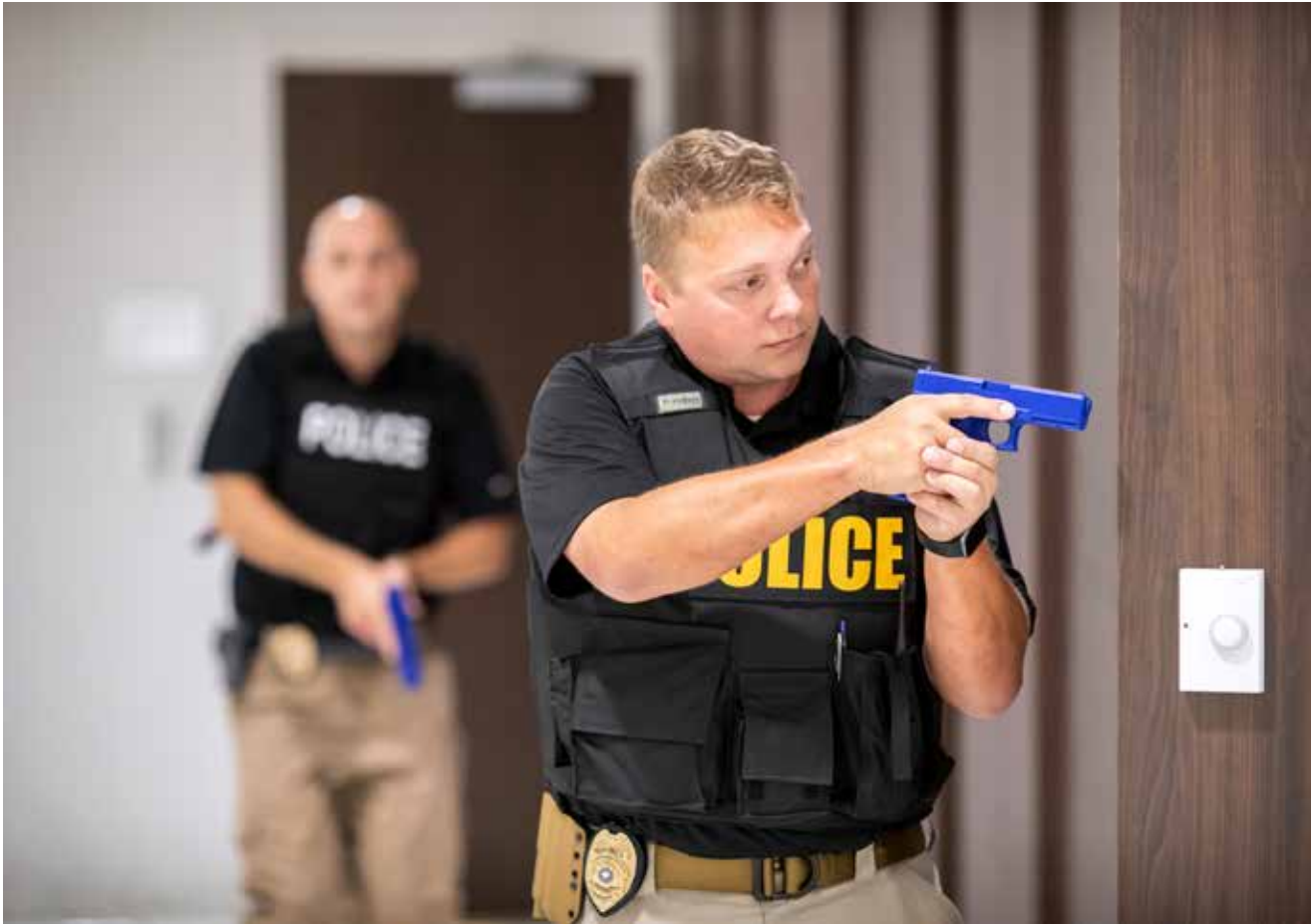
LSU Police participating in an active shooter drill on campus.