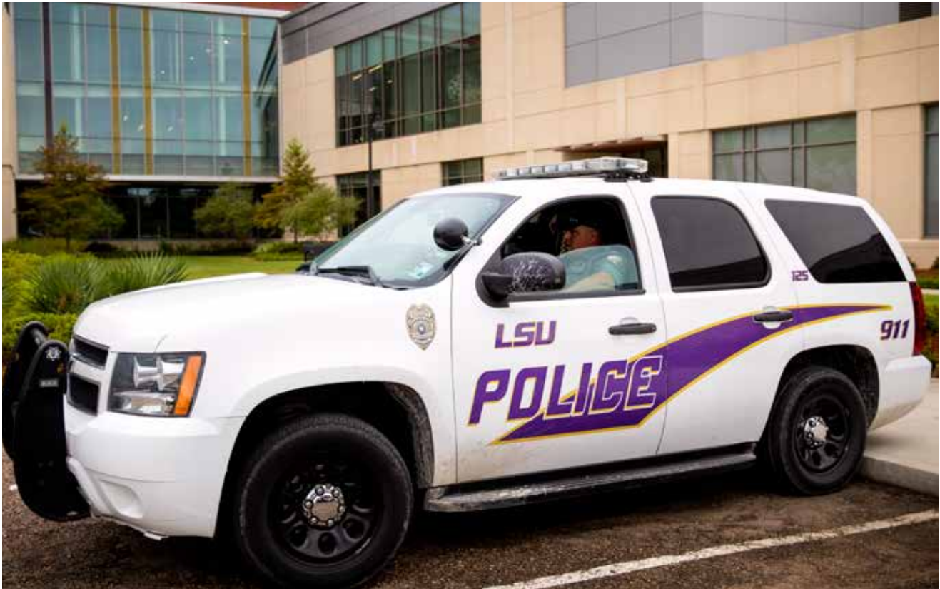
The LSU Police patrol the campus and surrounding areas 24 hours a day, seven days a week.