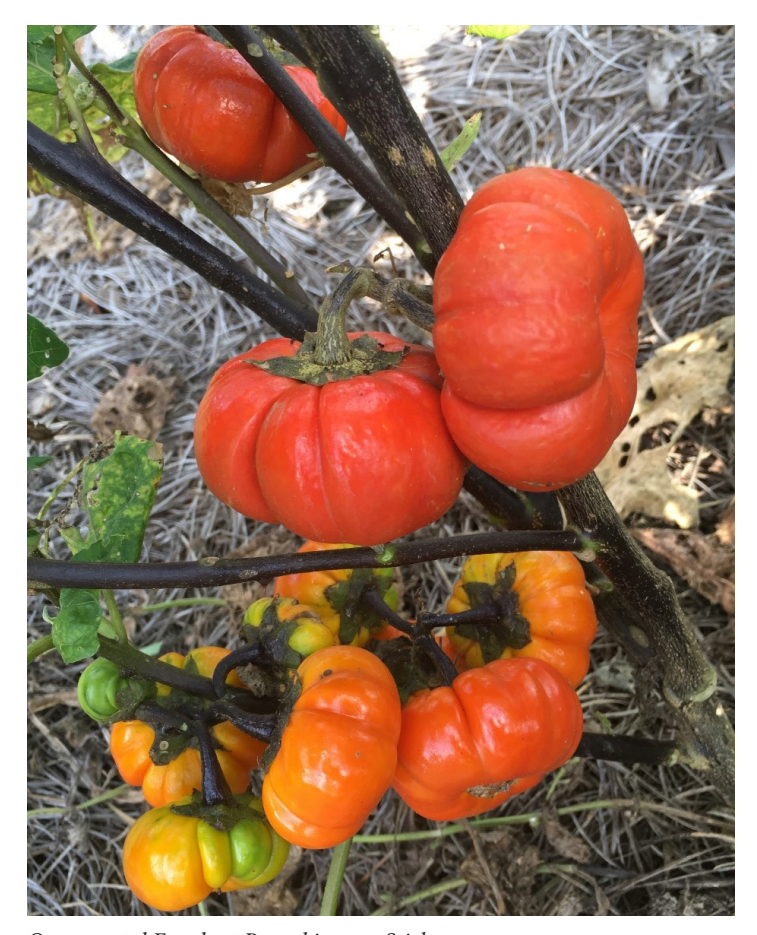
Ornamental Eggplant Pumpkin on a Stick

Another Halloween-themed plant from the children's garden is Hilo Buddha sugarcane. It has an amazing vertical variegation pattern, showing off bands of magenta and gold. This one always makes me think of witches' stocking, hence why it was planted. The sugarcane variety grows to a height of 8 feet tall and around 2 to 3 feet wide. It enjoys full sun and can survive until frost. When mature, the cane has an airy texture and has a very sweet taste — beautiful and delicious!