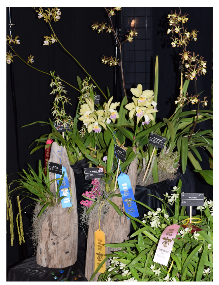
Baton Rouge Orchid Society Annual Show and Sale is held in the Ione Burden Conference Center in July.