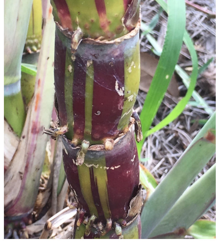
Ornamental Cane Hilo Buddha