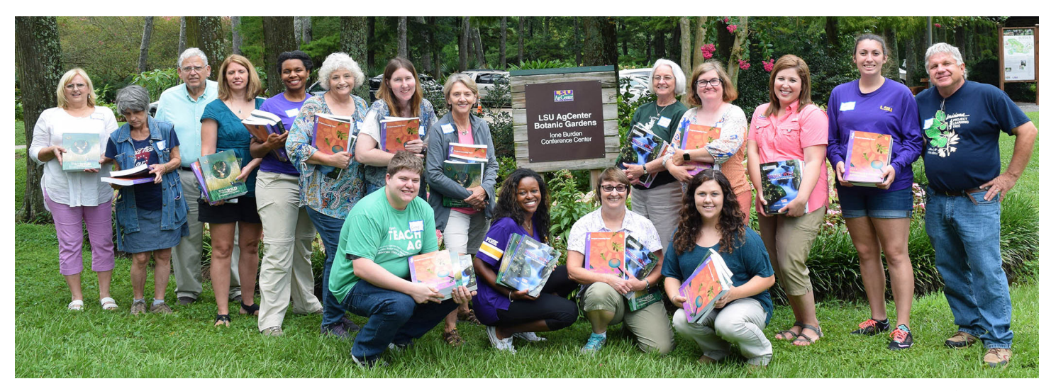
Participants in September Training