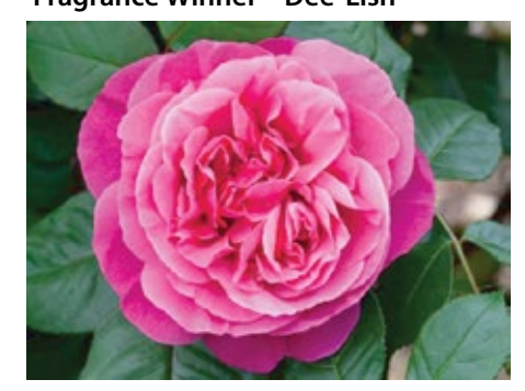
Dee-Lish is a tall growing hybrid tea rose with an old fashioned flower and a

Rose Selections 2016 continues on page 5